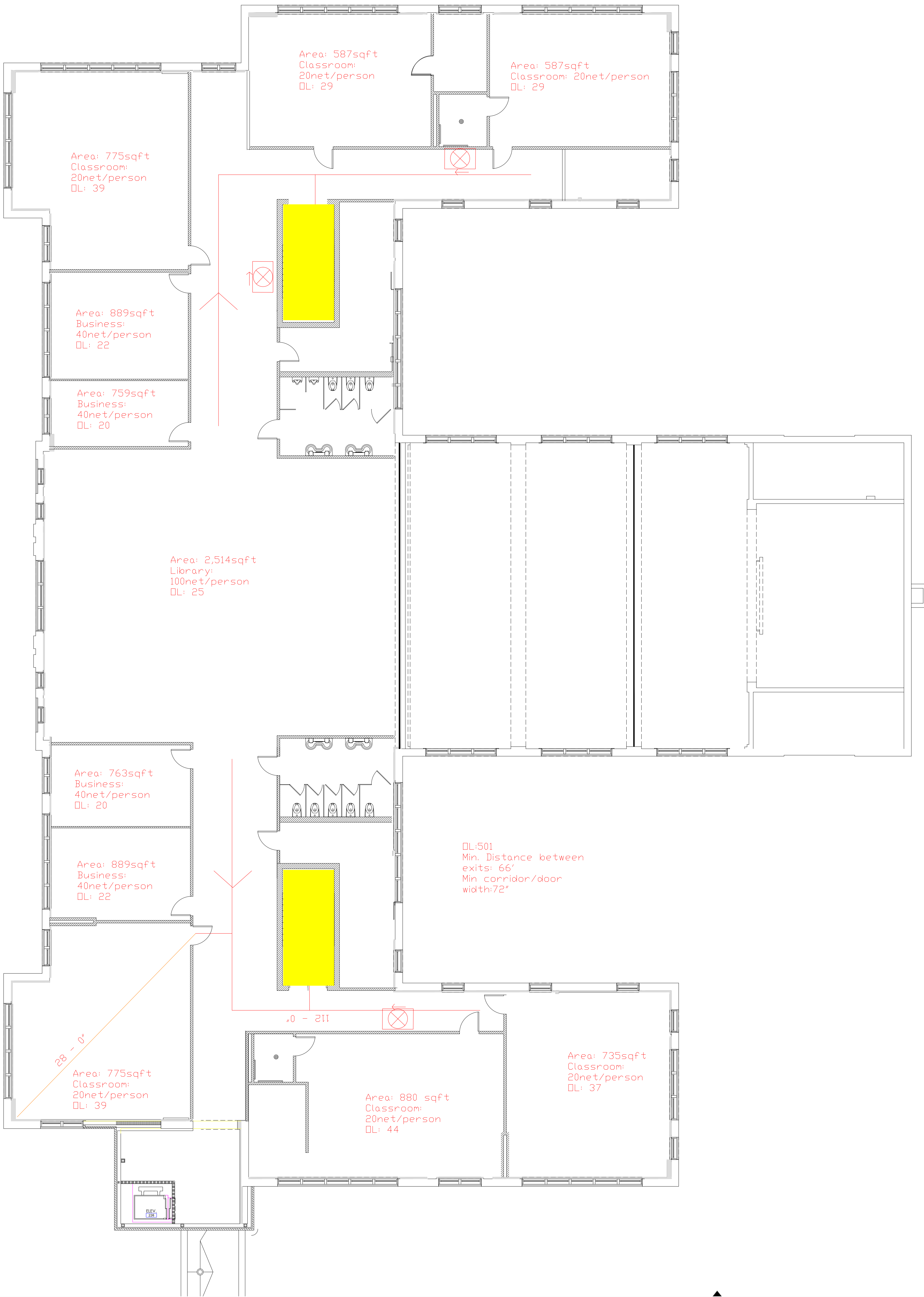
1 1st Floor Building A Scale: \frac{1}{8} "=1'-0"